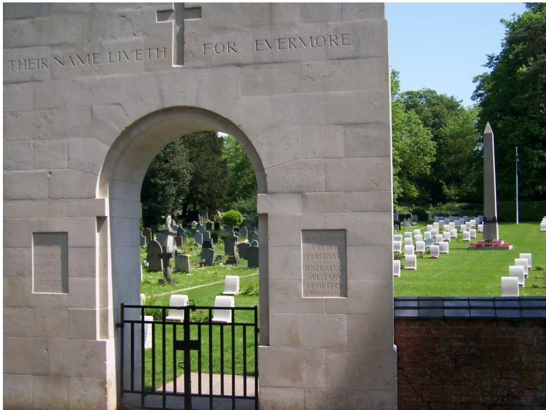
St. Mary the Virgin Churchyard, Harefield