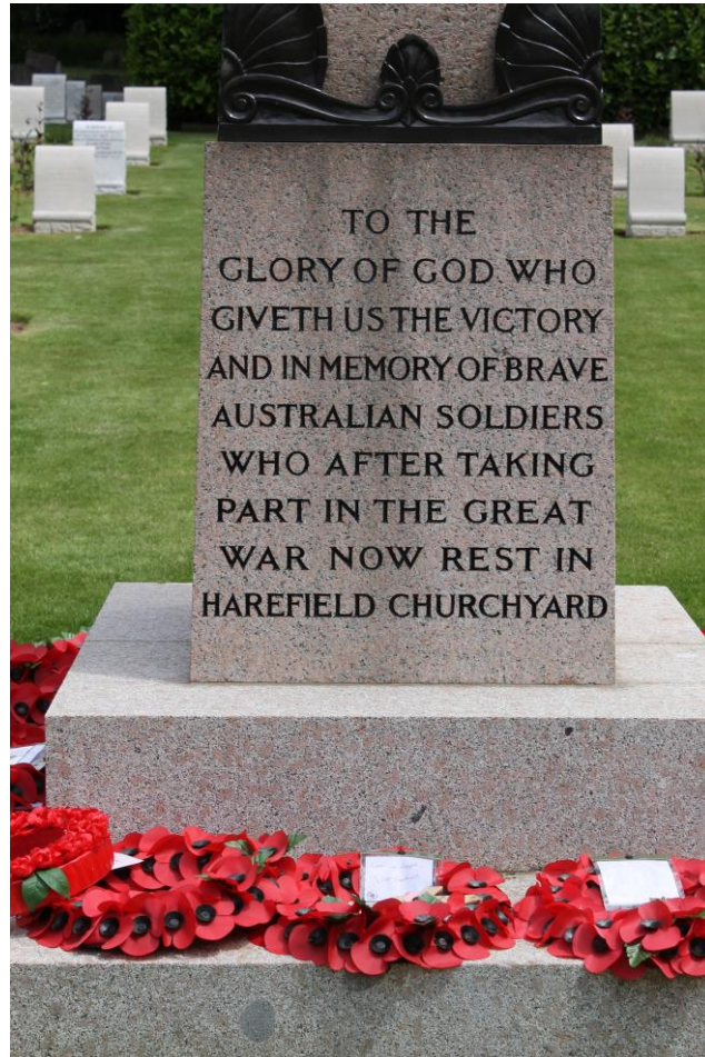
St. Mary the Virgin Churchyard, Harefield