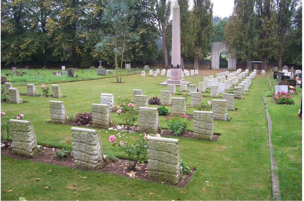
St. Mary the Virgin Churchyard, Harefield