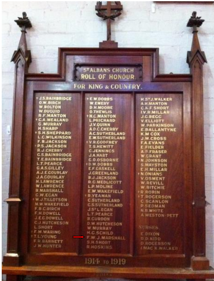
St. Albans Church Roll of Honour