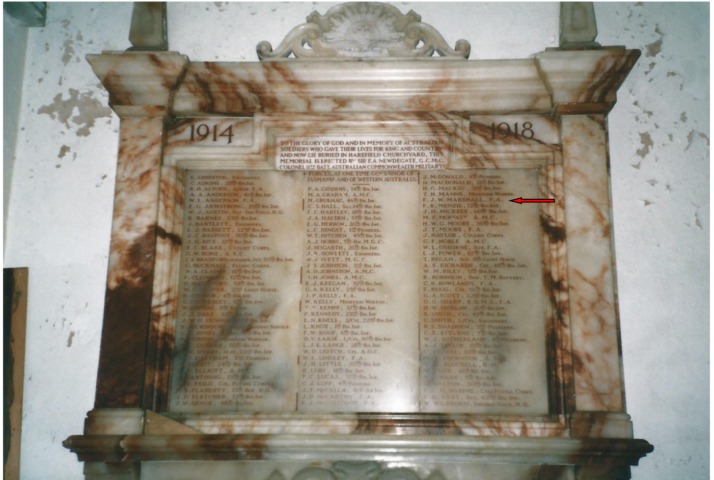
Australian Soldiers' Memorial, Harefield