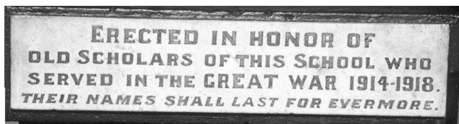
Errol Street Primary School Memorial Fountain