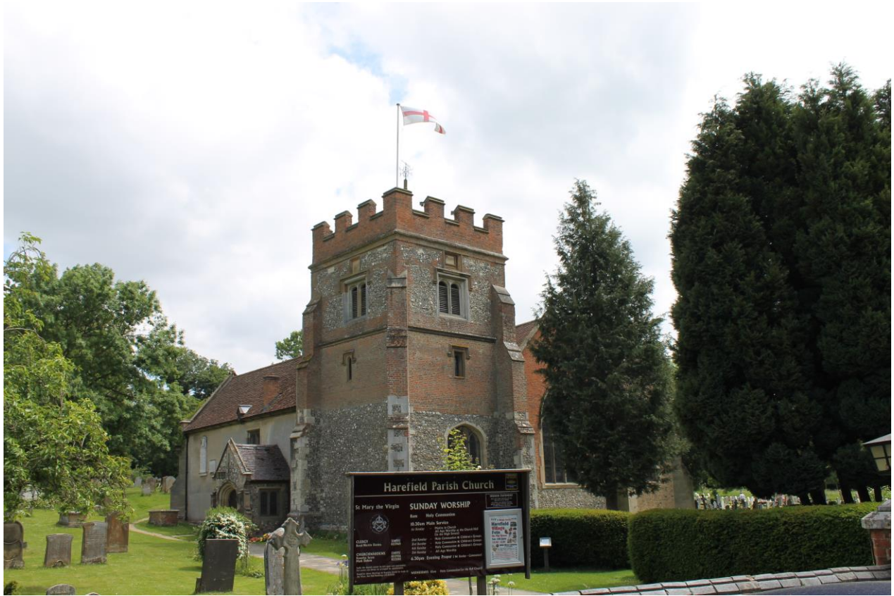
St Mary the Virgin Church, Harefield